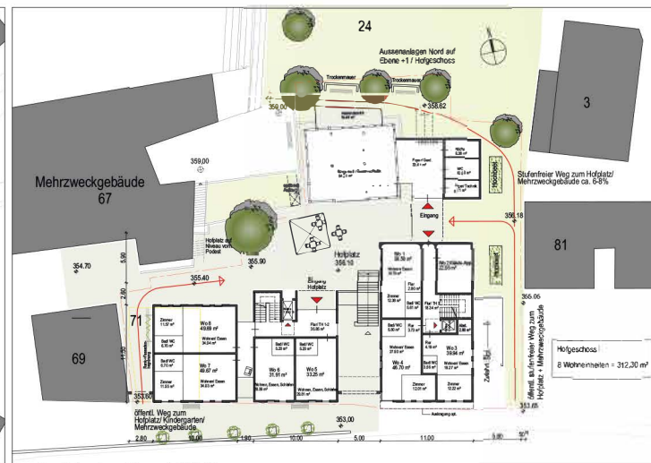
Grundriss Hofgeschoss Ebene +1 M 1-200