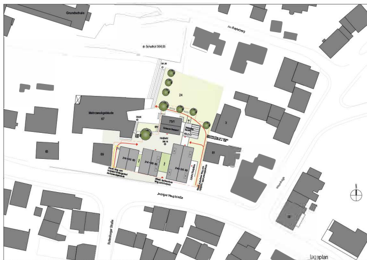
Lageplan M 1-500