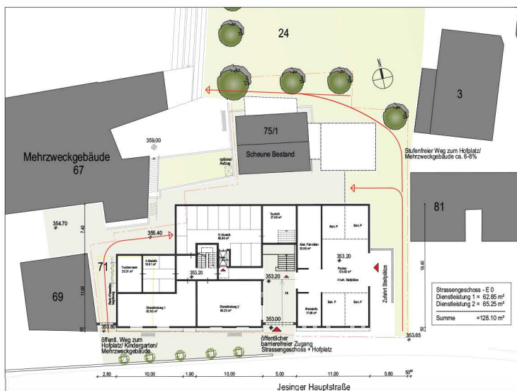
Grundriss Strassengeschoss E 0 M 1-200