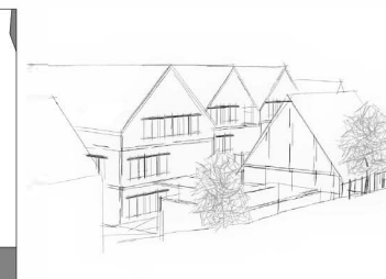
Perspektive Nord West