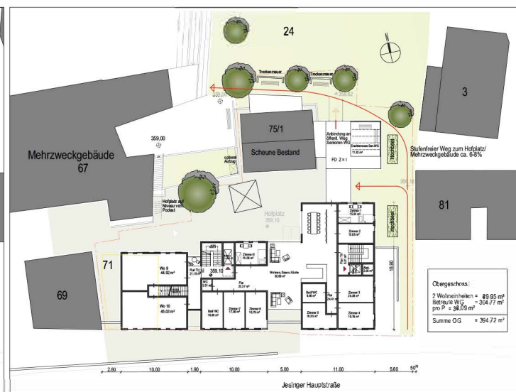
Grundriss Obergeschoss E+2 M 1-200