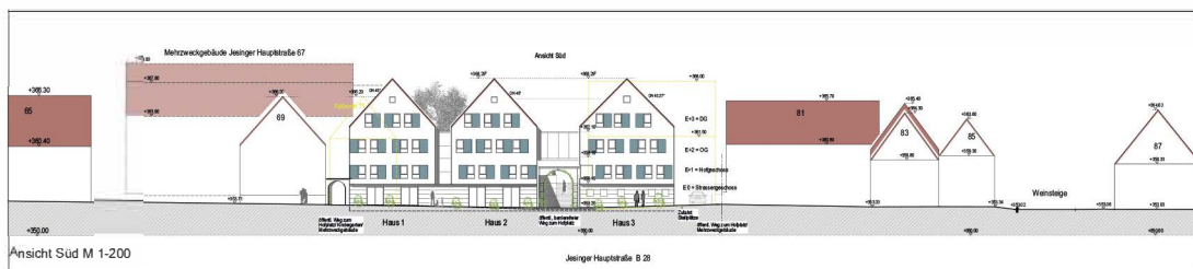
Ansicht Süd M 1-200