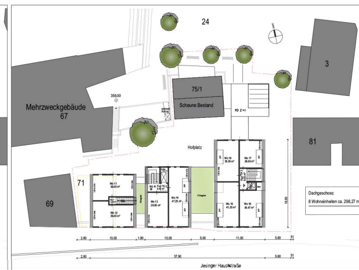
Grundriss Dachgeschoss E+3 M 1-200